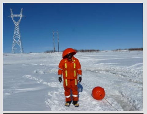
Placing marker balls on the transmission line マ トゾム′ マ・ム ⊲dਰ ′ ン⊲' 「σ^ዮ・△৮∧'