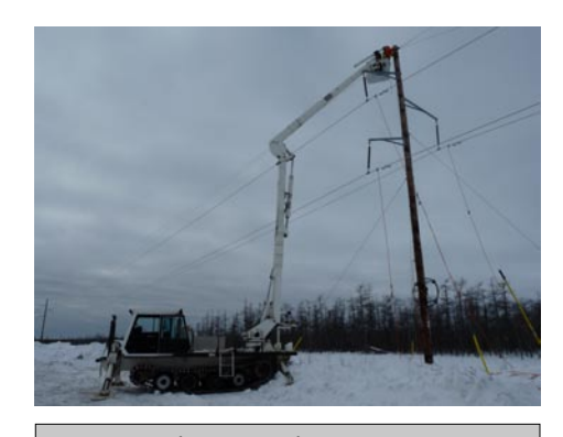
Winter Maintenance ∇ Λ>` ∇ ΛΓCσ·Δ` ▷Γσˆ Ρ·Δ ΔˇdU·Δ♭Λ♭