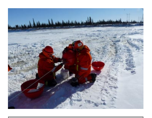
Placing marker balls on the transmission line \nabla \triangleright S\Delta' \quad \nabla \cdot \Delta dd\sigma' \quad Dd' \quad \Gamma\sigma^{\circ}P \cdot \Delta \wedge \Lambda'